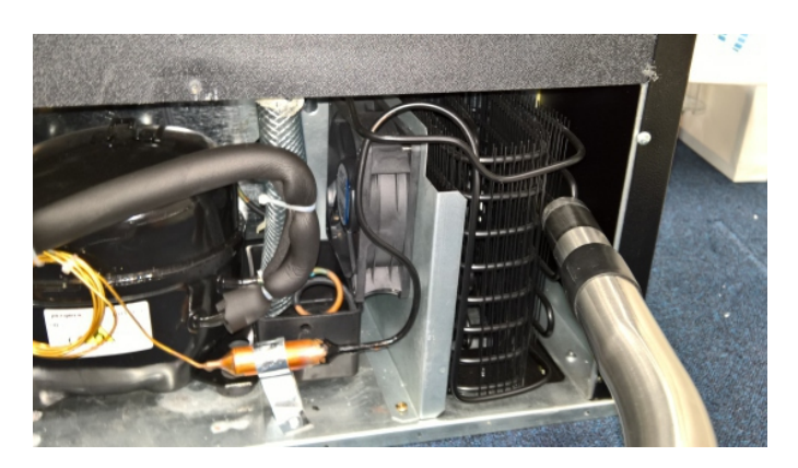
(2) Use vacuum to remove debris

• The condenser is located at the rear of the appliance behind the compressor compartment cover. The function of the condenser is to dissipate the heat that has been extracted from the interior of the cabinet. In order for it to work efficiently, it must be kept clean and free of dust at all times.