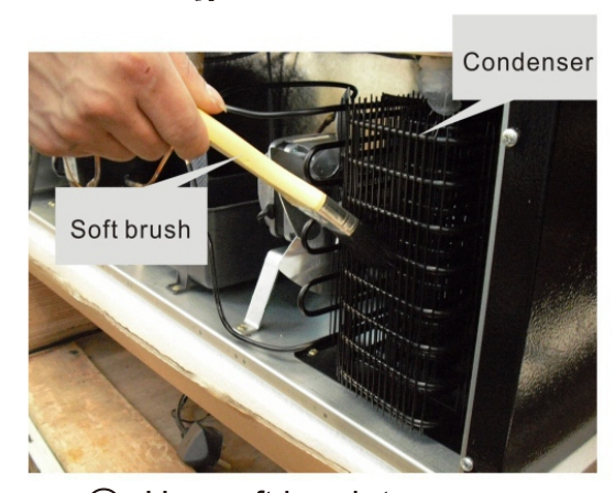
① Use soft brush to sweep